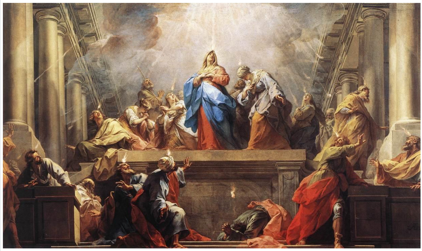
Pentecost, Jean II Restout, oil on canvas, c. 1732, Louvre Museum, France [Public domain]