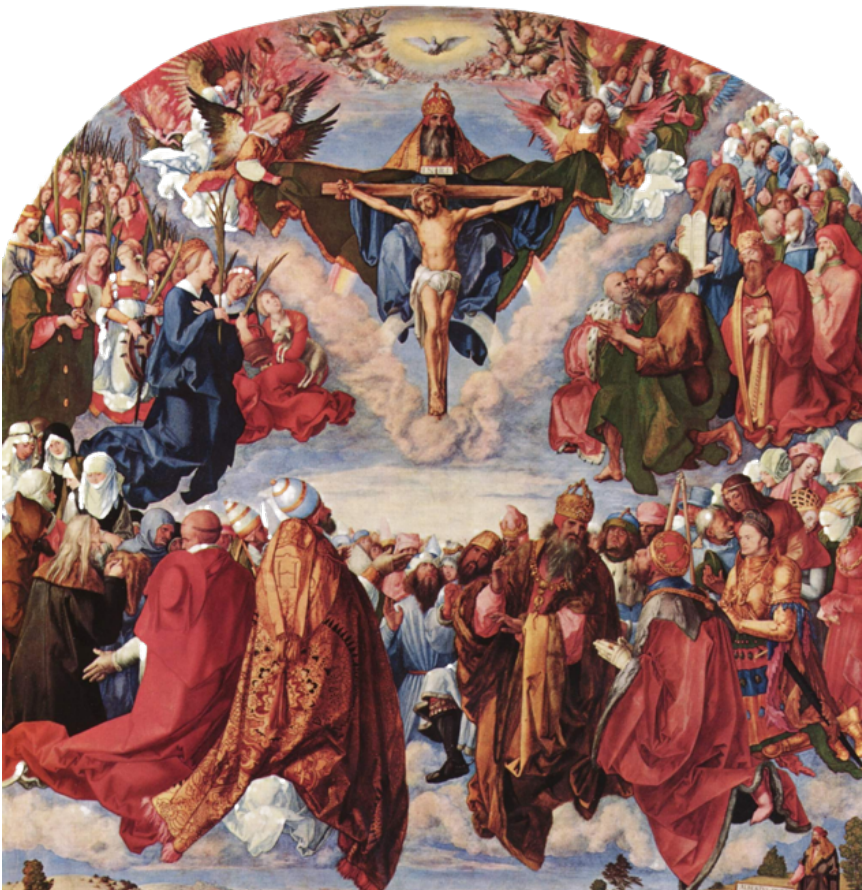
Albrecht Dürer's, Adoration of the Trinity . 1509-1511. Oil on poplar panel. Kunsthistorisches Museum, Vienna.